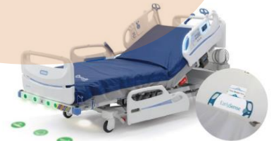
Patient Bed with enhanced patient monitoring Cost: $10,000

The holiday season brings families and friends together and provides much-needed time to reflect and give thanks for the many wonderful things that we have in our lives. This holiday season, consider donating to the Temiskaming Hospital Foundation. Your gift will help to purchase life-saving medical equipment that will make a difference in the lives of every member of the community.