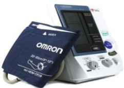
Automated Blood Pressure Monitor Cost: $5,500