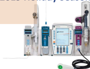
IV Pump with Poles Cost: $5,000